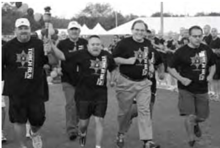
2008 Special Olympics Torch Run