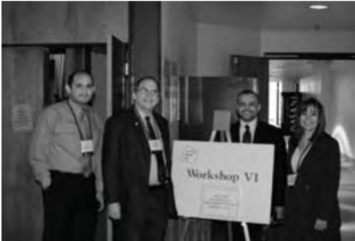
New Mexico Municipal League Annual Conference