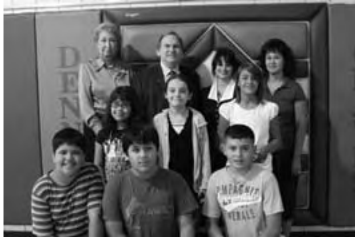
MethSMART© methamphetamine abuse prevention program with Boys and Girls Clubs of New Mexico