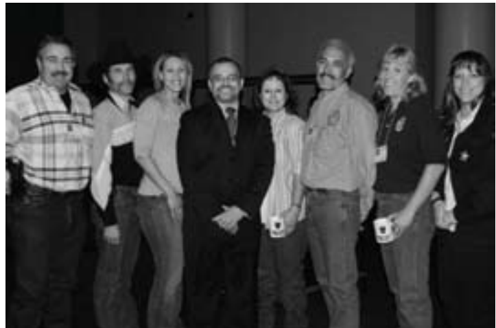
Statewide Animal Cruelty Taskforce training